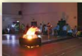
營燈晚會 The camplight evening party

日期： 2019年10月17至18日 地點： 上水馬草壟展能運動村 內容： 露營、燒烤、營燈晚會 Date: 17 to 18 October 2019 Venue: Community Sports, Ma Tso Lung, Sheung Shui Content: Camping, barbecue, camplight evening party