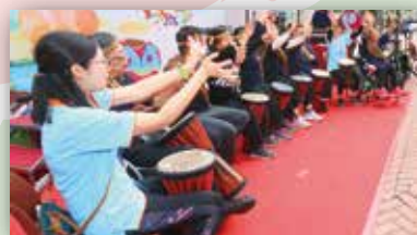
本會服務使用者表演「非洲鼓」。 Our service users gave a performance of playing the African drum.

日期： 2019年12月21日 地點： 將軍澳廣明苑露天廣場 內容： 表演、展覽、攤位遊戲 Date: 21 December 2019 Venue: Open Square of Kwong Ming Court, Tseung Kwan O Content: Performances, an exhibition and booth games