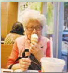
展能組冠軍作品 The winning entry of the disabled people's section