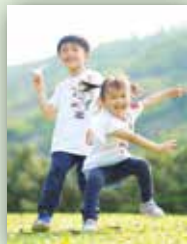
公開組冠軍作品 The winning entry of the general section