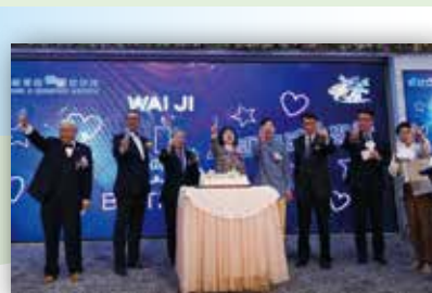
本會董事、總幹事及家屬代表會主席向眾出席者祝酒。 Our Directors, Chief Executive and Chairperson of the Family Representatives Association toasted the participants.

日期： 2019年12月12日 地點： 沙田石門京瑞廣場2期富臨皇宮酒樓 內容： 聚餐、聚餐前活動、頒發員工長期服務獎等獎項 Date: 12 December 2019 Venue: Fulam Palace Restaurant, Kings Wing Plaza 2, Shek Mun, Shatin Content: Dinner, pre-dinner activities, presentation of long service awards for staff and other awards