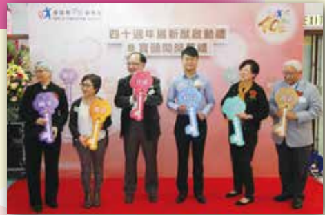
主禮嘉賓與本會董事及總幹事主持啟動儀式。 The officiating guests, accompanied by our Directors and Chief Executive, conducted the kick-off act.

Date: 12 January 2019 Venue: Day Activity Centre and Hostel at Po Lam Content: Commencing the programmes for our Agency's 40th anniversary and marking the opening of Po Yee Corner, our first day service corner for elderly people with intellectual disabilities.