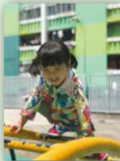
親子組冠軍作品 The winning entry of the parents' and children's section