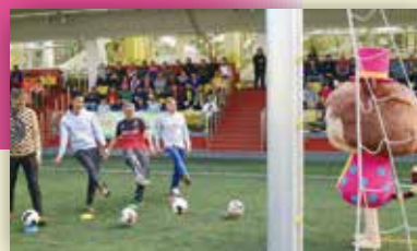
嘉賓與本會董事主持開球禮。 The guests conducted the kick-off act with our Director.

日期： 2019年12月6日 地點： 天水圍天業路公園 內容： 足球遊戲、足球比賽 Date: 6 December 2019 Venue: Tin Yip Road Park, Tin Shui Wai Content: Football games and matches